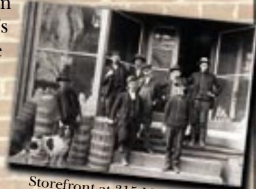
Storefront at 315 Main Street