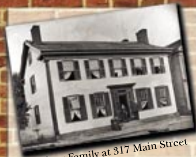
Milner Family at 317 Main Street